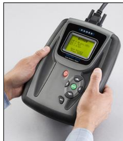
Figure 2: Spectro CA-12 battery tester Measures capacity and CCA in 15 sec.

The generic matrix of the Spectro CA-12 GA passes or fails a battery on a capacity threshold of 40%. Numeric capacity readings are possible with a custom matrix. Other matrices measure battery state-of-charge by impedance and check battery formation in manufacturing.