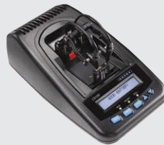
C7X00 PROFESSIONAL ANALYZER More at cadex.com/c7