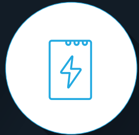
Complex Battery Contacts