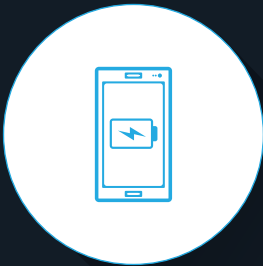
Small, Rechargeable Batteries