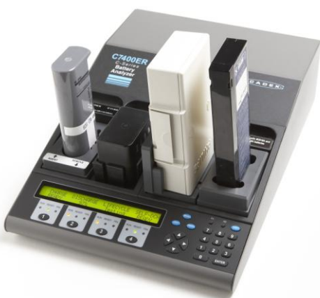
Figure 4: Cadex C7400ER Series battery analyzer

Battery analyzers have made critical inroads into the medical industry. The Cadex C7400ER illustrated in Figure 4, for example, services four batteries independently. Battery adapters permit plug-and-play, automated programs provide hands-off service and manual operation enables the setting of unique parameters. PC-BatteryShop™ software allows operation from a PC; a simple mouse click or swiping the bar code label on the battery configures the analyzer.