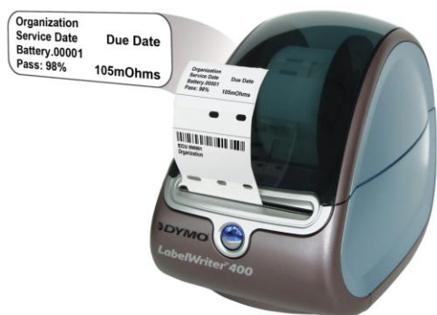
Figure 5: Battery management with labels

Battery labeling offers a simple and practical way to manage a battery fleet. PC-BatteryShop™ generates labels showing capacity, service date and due date. The system is self-governing in that the user will only pick a battery with a valid service date and sufficient capacity. Batteries reaching the service due date are removed and run on a battery analyzer. Figure 5 illustrates a printer with a sample label.