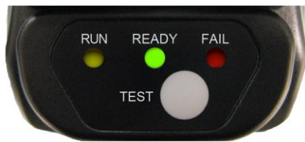
Figure 5: Panel of the HealthTest Charger™

The charger also assists in incoming inspection to verify proper function before releasing the batteries into the field. Another useful application is inventory control by evaluating unknown packs that have accumulated in boxes. Many batteries are protected with diodes and the HealthTest Charger™ can also service these, but the manual TEST is not possible. Figure 5 shows the user-interface of the charger.