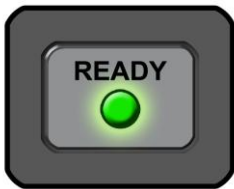
Figure 1: The “ready” light lies

The “ready” light on a battery charger will eventually illuminate, but this does not mean “able.” There is no link between “ready” and battery performance. The amount of energy a battery can hold is measured in capacity, a value that gradually decreases with use and time. A faded battery charges quicker than a good pack because there is less to fill. Being ready first causes bad batteries to gravitate to the top, to be picked by the unsuspecting user. There is a caution: The “ready” light may give a false sense of security.